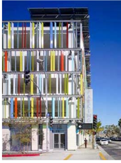
Civic Center Parking Structure