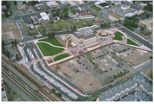
Hayward City Hall and BART Intermodal Transfer Station

Featured in <u>"One Way Out of the Jam: Transit-Oriented</u> <u>Development</u>," a video about the new city hall development site, prepared by the Association of Bay Area Governments (ABAG) and BART.