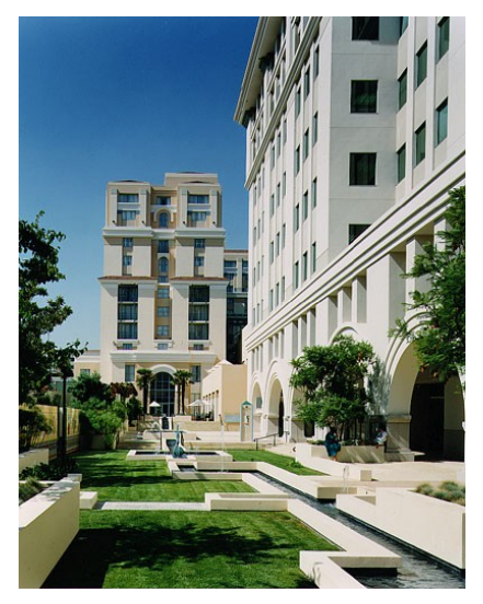
Plaza Las Fuentes

Guided special economic development programs and activities that required extensive coordination, facilitation and contracting among the business and financial community, state and federal agencies, and the local government.