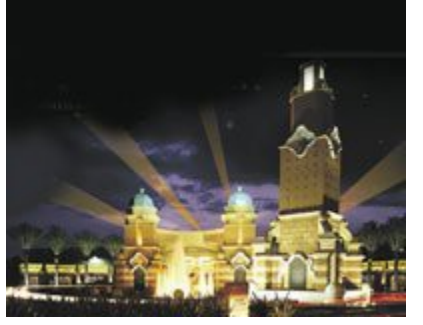
Casino San Pablo